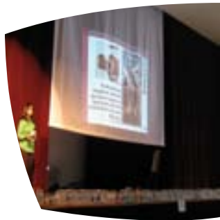
Eco Assembly February, 2010

Vanier's SAGE Team is committed to remind everyone to reduce, reuse, recycle and re-think.