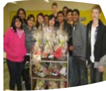
Company members with the Gift Baskets, December 2009

The Company @ Vanier program is the new Commercial Entrepreneurial Venture. It