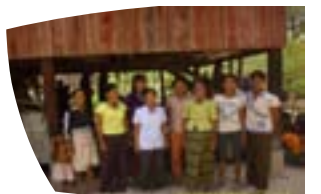
Farmers in Cambodia

Championship is given to entrepreneurs in Philippines, Kenya, Ukraine and Sierra Leone. www.kiva.org/lender/SAGEGeorgesVanier