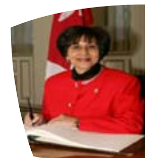
Yasmin Ratansi, Member of Parliament

a representative from the Canada Revenue Agency. A Personal Finance workshop was hosted by representatives from the Royal Bank of Canada.