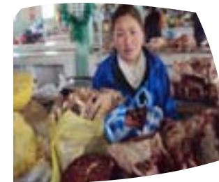
Onon is a 24 year old entrepreneur living in Mongolia. She operates a food stall to support her family.

KIVA empowers people to help entrepreneurs around the globe through micro-lending to alleviate poverty.